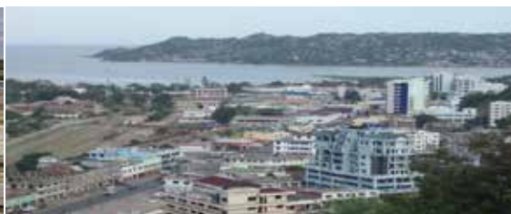
The city of Mwanza