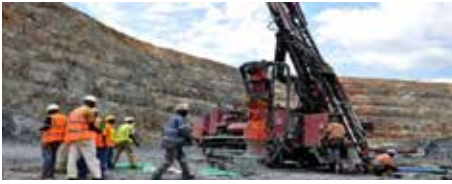
Gold mining at Misungwi in Mwanza Misungwi in Mwanza