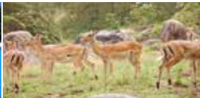
Bismarck Rocks in Lake Victoria Saanane Island and Impala at Saanane Island National Park