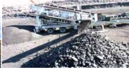
Diamond mining at Misungwi in Mwanza