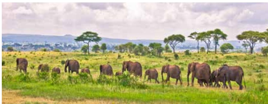
Elephants at Tarangire national park