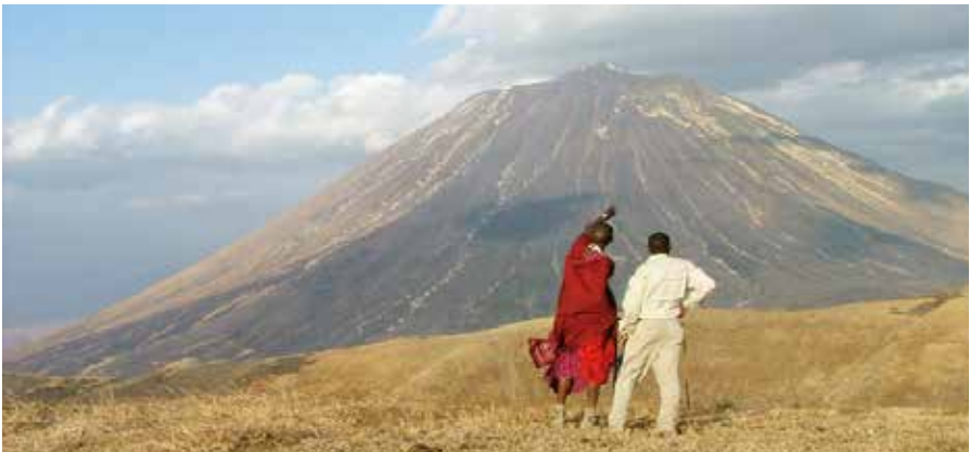
Mount Meru in Arusha

Activities include Mount Meru climbs, boating on Lake Duluti, a 211 Museum, snake parks, shopping in the curio shops, bazaars and cultural heritage centres etc.