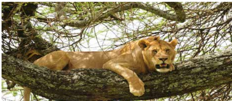
The very rare climbing-tree Lions are found at Manyara national park

Manyara is a sanctuary to elusive populations of buffalo, hippo, giraffe, impala, zebra and the most famous residents-tree climbing lions. Elephants feed off fallen fruit while bushbuck, waterbuck, baboons, civet, leopards as well as black rhinos make their home in the forest. Lake Manyara is a magnet for birds' life and a kaleidoscope of different species which can be found around its shores, including huge flocks of flamingo. The Park is ideal for a day trip from Arusha town. The tourist season is from June to September and January to February. Visitors' facilities are a hotel, camp sites, a hostel and self-catering "bandas".