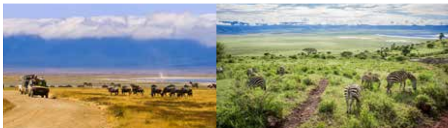
Different animals at Ngorongoro conservation area

The Ngorongoro Conservation Area is a huge area containing active volcanoes, mountain and archaeological sites, rolling plains, forests, lakes, dunes and of course, Ngorongoro Crater and Olduvai Gorge. The view of Ngorongoro crater is sensational. On the crater floor, grassland blends into swamps, lakes, rivers, wood land and mountain- all a haven for wildlife, including the densest predator population in Africa. The crater is home to up to 25,000 large mammals mainly grazers. The crater elephants are strange, mainly bulls. The birds' life in the crater is largely seasonal. In the northern, remote part of the NCA are Olmoti and Empakasi craters, Lake Natron (known to breeding ground for East Africa's flamingoes) and Oldonyo Lengai Mountain. Visitors' facilities include luxury lodges and campsites such as Ngorongoro Wildlife Lodge, Ndutu Lodge and Conservation Corporation (East Africa).