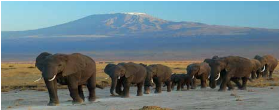
Elephants at Arusha national park

Visitors' facilities are camp sites, mountains huts, rest houses and the Momela Lodge.