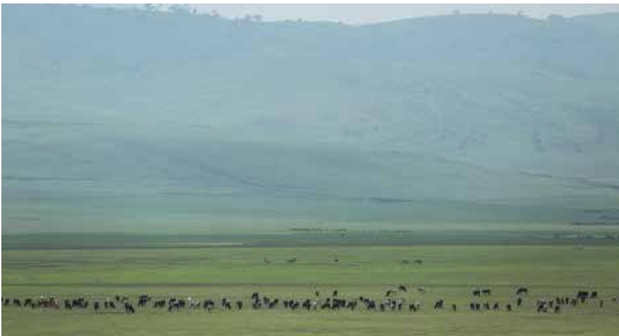
Cattle pasturage in Arusha

Pastoralism mainly includes Cattle (Indigenous and exotic), Sheep and Goats.